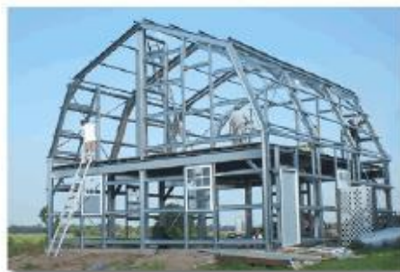
Light Ga. Structural