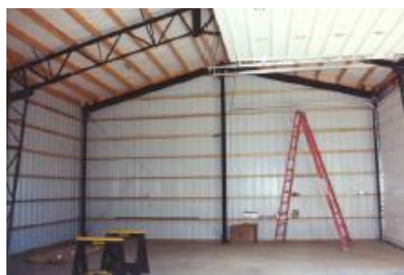
Open Web Truss